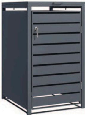
Anthracite RAL 7016