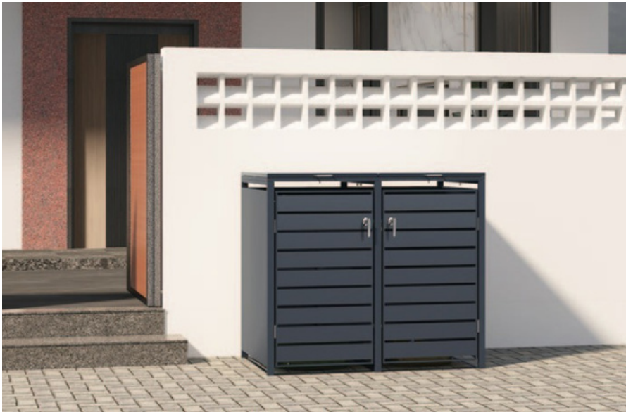
Anthracite RAL 7016