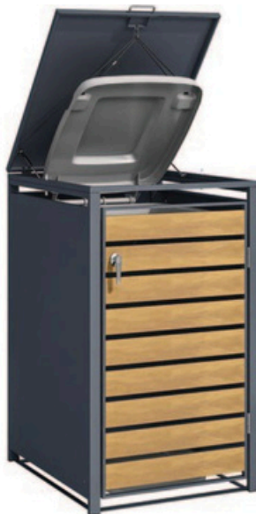
Oak Wood Effect